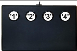
Default MilliKey LH-4 Button to Keyboard Key Mappings