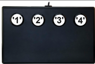
Default MilliKey LH-4 Button to Keyboard Key Mappings