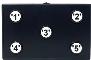
Default MilliKey LH-5 Button to Keyboard Key Mappings