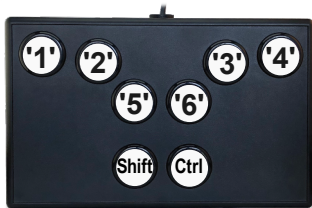
Default MilliKey LH-8 Button to Keyboard Key Mappings