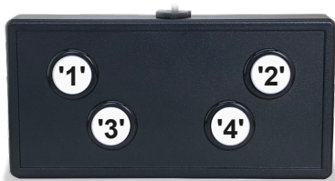
Default MilliKey MH-4 Button to Keyboard Key Mappings