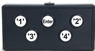
Default MilliKey MH-5 Button to Keyboard Key Mappings