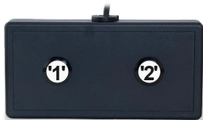
Default MilliKey SH-2 Button to Keyboard Key Mappings