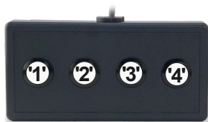
Default MilliKey SH-4 Button to Keyboard Key Mappings